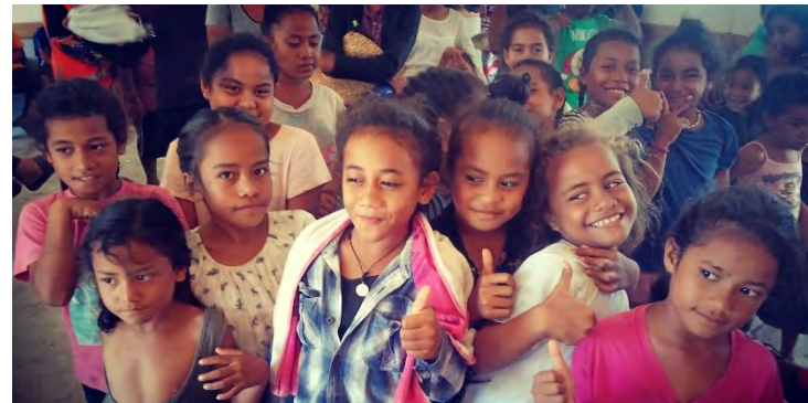
Children in Tonga, Nomuka Island are still able to put a smile despite all their homes were destroyed by the Volcano eruption