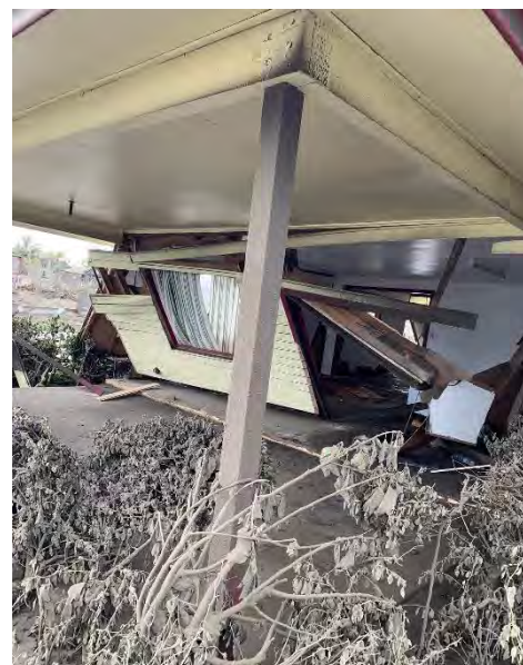
The front side of the house

There we were fed and spent the night. Sabbath morning came, we had our devotion and Pr Fanueli suggested if we wanted to go see the mission office compound where our house was located. We agreed and we headed back to the mission compound. When we left the compound the previous night, our house was still standing and the mission office was still intact. Along the way, we saw the destructions. Houses and everything was covered with thick ashes. Everything that day was only one color, the color of the volcanic ashes. The waterfront were badly destroyed. The footpath that we once took our walk on to and from work were broken and thrown everywhere. The big coral rocks that were used as a seawall were tossed everywhere in land. Everything was completely destroyed. Upon our arrival to the mission compound, we were dumbfounded and shocked by what we saw. No words exchanged only silence was felt. Our house was completely destroyed. Our belongings were all gone and destroyed. The mission office and equipment, books and all other things were destroyed. We have never felt so homesick and discouraged. God has called us to come and serve Him here in Tonga, and this is what we get?