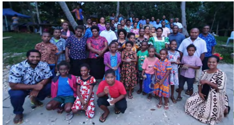
Epauto Staff and their families

"Get Together, Get Connected" was the theme for Epauto Adventist Senior Secondary School staff retreat that took place at Gideon's Landing, North-West of Efate from the 28 th to the 30 th of January 2022. The school administration decided to organize the retreat in order to get to know the new teachers and their families, redirect the focus of the teachers and empower the teachers to meet the challenges of 2022 with God.