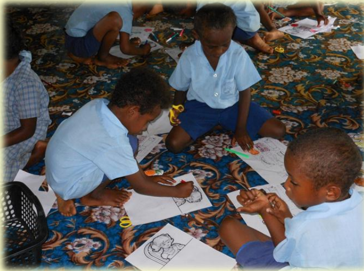
Pre-school students at Burns Creek.

As communities and societies change and respond to and copy western lifestyles, pre-schools and early childhood groups start popping up like mushrooms. The same is now true throughout the Pacific and there are so many new groups starting up. Some are in schools and some are in homes or church rooms. Here are a few photos of such groups and their facilities. If you would like a CD of resources to assist you then send me a letter or e-mail and I will send material up to you. My details on page 1 of this newsletter.