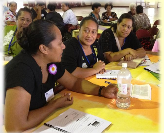
KID participants involved in a Bible discussion