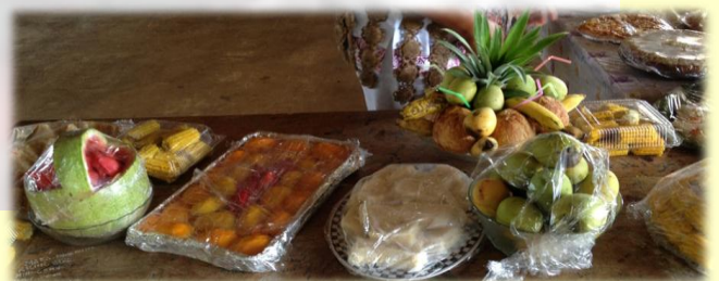
And don't forget the delicious food, heaps and heaps of it!!