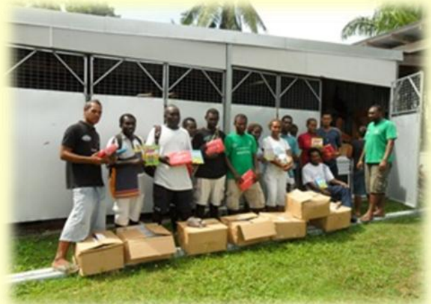
Fulton College Certificate graduates collecting their supplies.