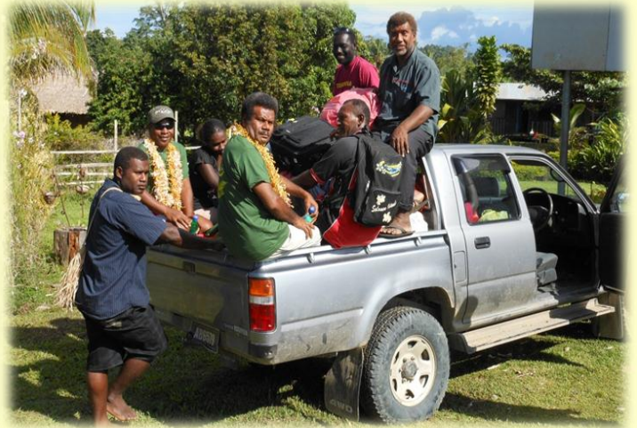
Getting ready to leave Tenakoga for Honiara