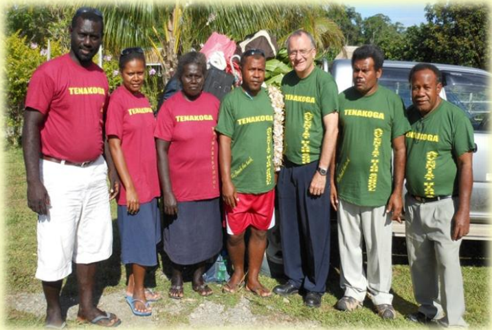
What a beautiful and handsome lot this group is