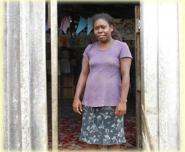
Pre-school teacher at Tenakoga