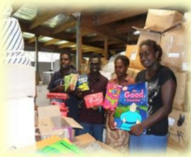
Teachers from Tangibangara primary school, from the remote island of Choiseul, collecting their resources