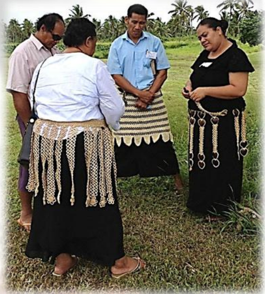
Teachers involved in a prayer walk.