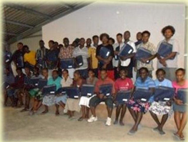
This picture was taken after the certificate teachers were given their bags.