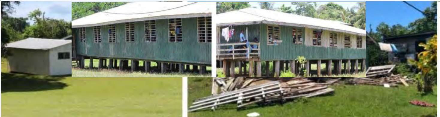
The school canteen on the left and the principal's house on the right that fell down

There were 23 out of 28 houses have been damaged. The effect of the quake left 9 houses to be tilted, swayed and uninhabitable. These houses were uninhabited due to tilted posts and detached noggings, braces, and bearers from each other. Only two buildings; Principal's house and school canteen were completely fell down to the ground.