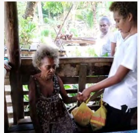
Students participating in public preaching and home visitation