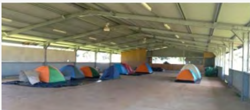
Temporary families residing in the school hall