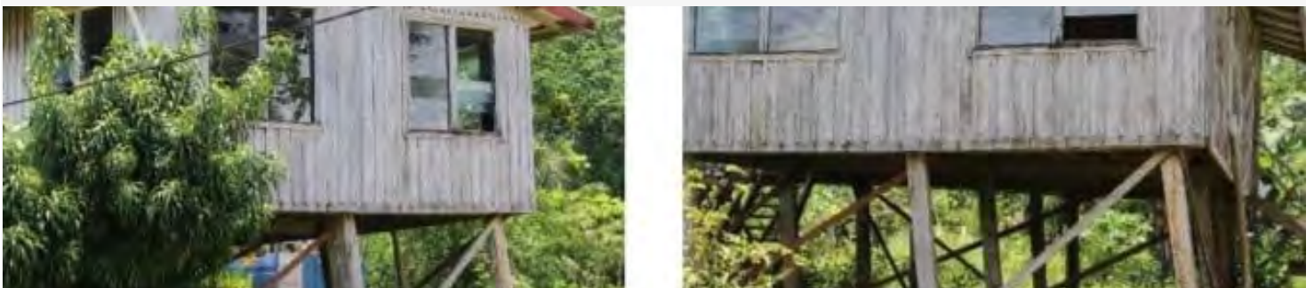
Houses that has tilted posts