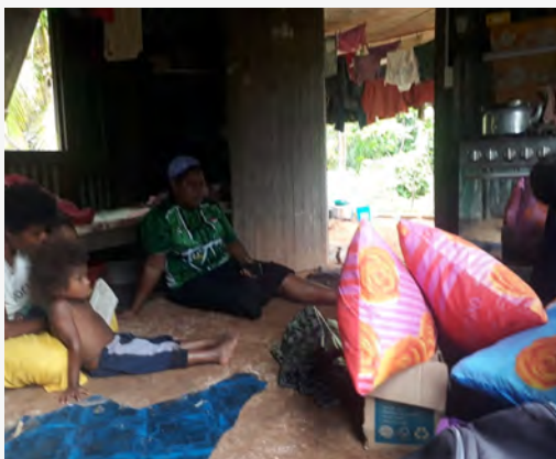
2. The struggle for student family is real