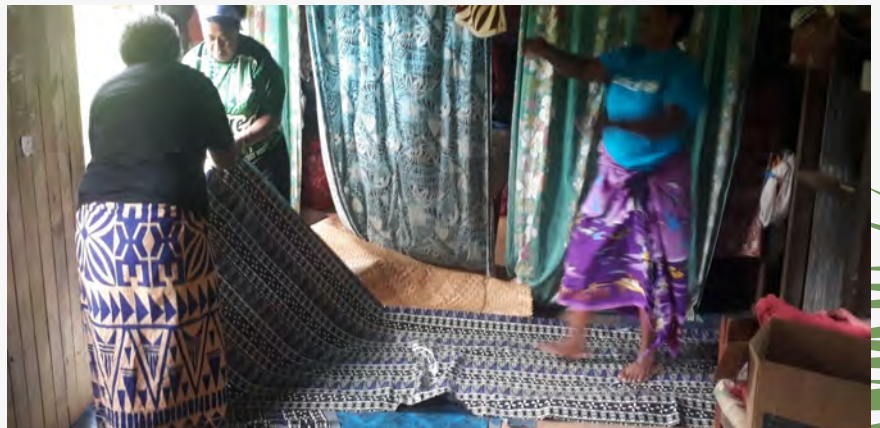
3. House cleaning and set up. Teachers do the work themselves