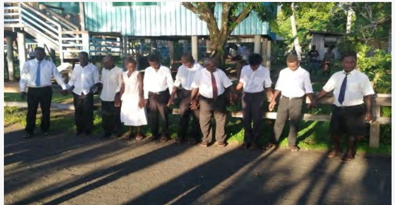
Photo above shows another group of Baptismal candidates (7), standing in front of the Pastor’s house, preparing to enter the water of Baptism. They were led by our three Ministers. This baptism was done on the second Sabbath morning after first above. Marked are four (4) Buruku high school students who decided to be baptized at the end of our One week campaign ran locally in our community.

These were the candidates who chose to be baptized at the end of our three weeks “TRUTH FOR TODAY” crusade down linked at the School’s Compound during the School’s midyear break.