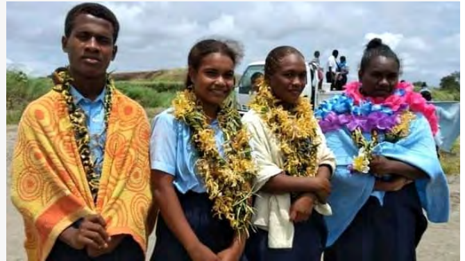
The 4 non-Adventist students after baptism

Among those baptised recently were 4 non Adventist. - Partinson Bekala