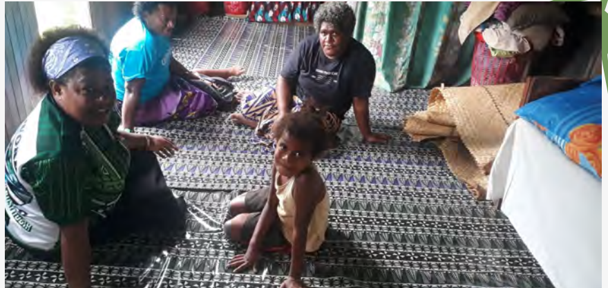
4. Now the 3 students from this family will enjoy working with their worksheet in this clean Lino and conducive house.

Character development is certainly a major goal of Adventist Education.