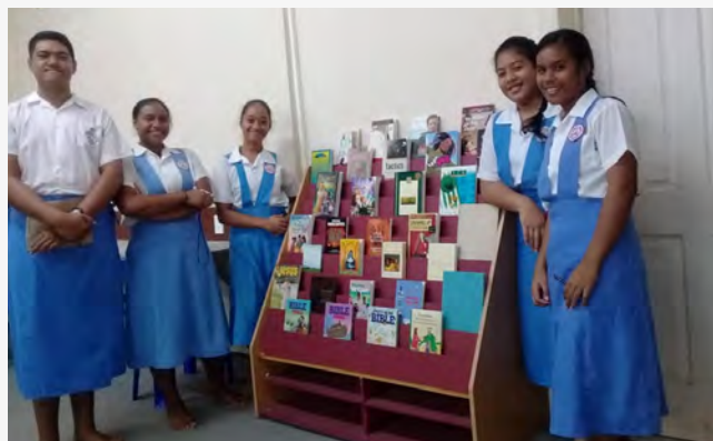
Students smiling and very proud of their school library