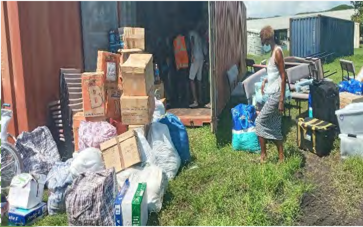
Unloading container at the Maranatha Hall by volunteers

The schools, children, parents and churches are indebted to the continuous support coming from families, individuals and retirees - including non-Adventist supporters.