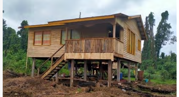
One of the 3 new staff houses