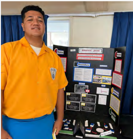
Tavillacollin Puni 1st Place overall Engineering Category

Grade 5 - 3rd place (Topic: Which of the following local filters can turn lemon tea soda to purified water?)