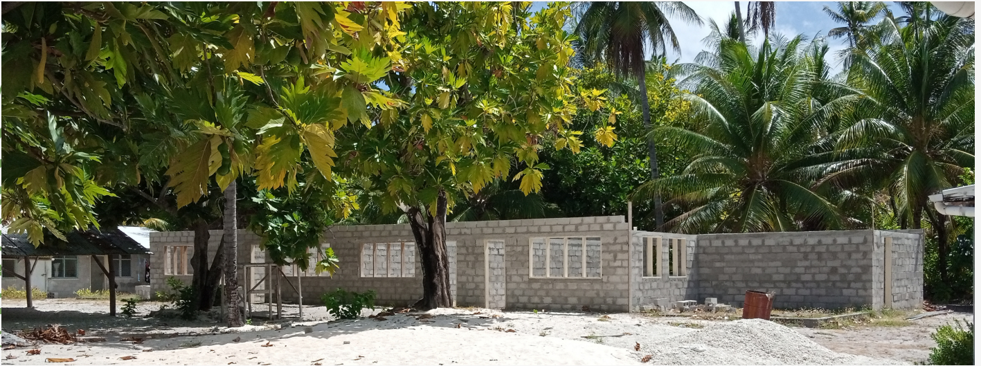
New Classroom Building yet to complete

The Kiribati Government now offer free education to secondary school students both to Government and Church schools, which started in 2021, thus Kauma Adventist High School in Kiribati located in the island of Abemama intake for 2022, like last year's, has drastically increased to about 500. Such an increase has a number of impacts on the infrastructure of the school in terms of: