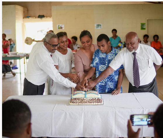
Cutting the thanksgiving cake

The closure of schools in Fiji for more than six months because of Covid-19, before Years 12 and 13 returned for face to face classes on November 1st created a huge challenge to teachers in trying to prepare the students for their External exams. Even the giving out of worksheets and the online classes when schools were closed proved to be an exercise in futility.