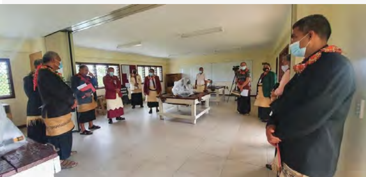
Resources for the new Industrial Art Room