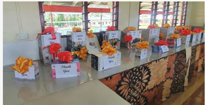
Resources for the Home Economic Room