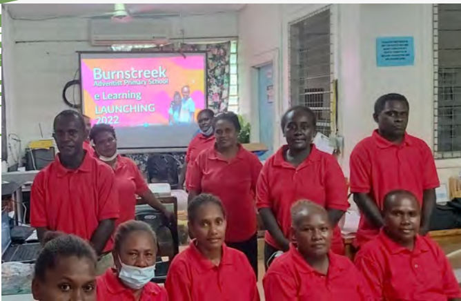
Burns Creek SDA Primary Staff

Representatives from the Solomon Island mission Education Department, Ministry of Education & Human Resources Development Stakeholders, school principals witnessed the launching of the online learning for Burns Creek SDA Primary School in the Solomon Island, on Tuesday the 10th of May 2022. This new technology is the first ever medium and platform the school established to enhance students continuing learning at home whilst facing the COVID- 19 pandemic. The initiated online program is a creative educational teaching approach done by