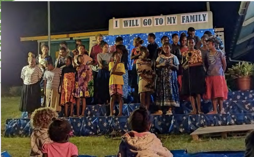
Class 6 with their special items