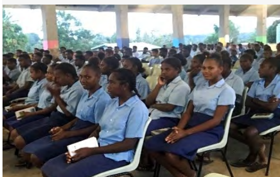
Tenakoga students looking neat and tidy

Special Character clearly demonstrated at Burns Creek Primary School