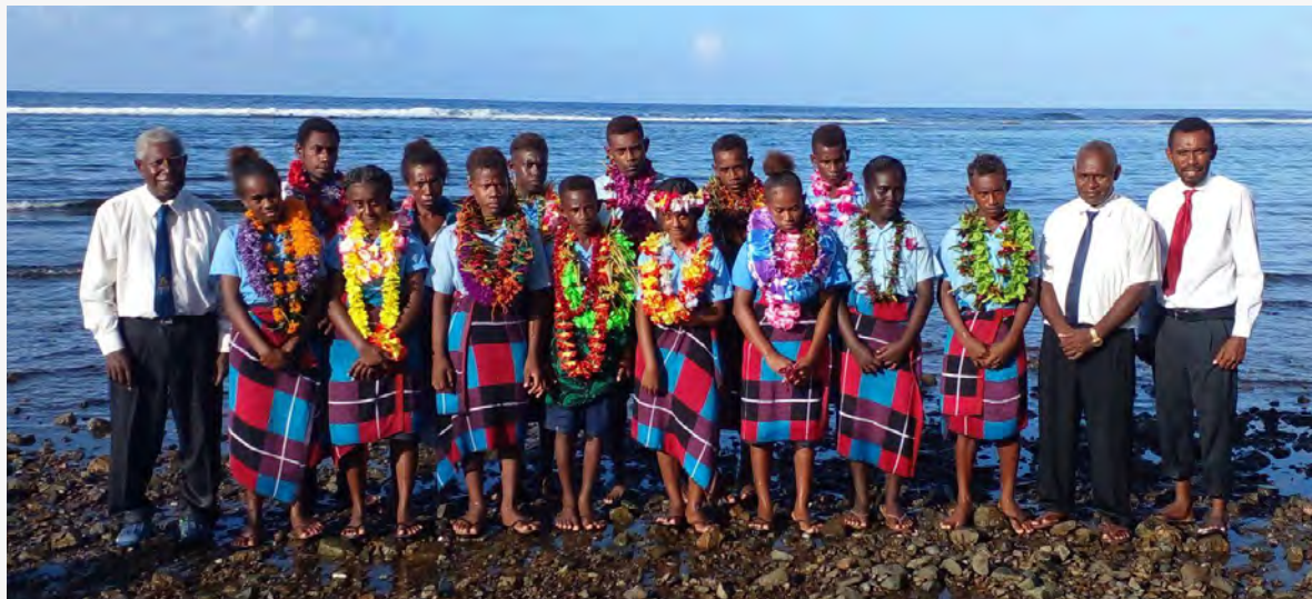
Kopiu Adventist High School Baptism

It has been a challenging year for schools country wide in the Solomon Island. For Kopiu Adventist High School, classes started very late, midway through term one, that is, late June. Despite starting late, straight after the school registrations and resumption of classes, the school enrolled students in Bible study class. The initial class started with 14 students. After spending about one month of studies (3 days of study per week), the school organized it's first Spiritual Emphasis Week (17th – 23rd July). Nightly meetings, on "God's Present Truth for Today" Reading. And with the help of the teachers, taking morning readings, "The Three Angels' call to Pray." During the final night an appeal was made and decision cards were given out to all students. Apart from those who have indicated their decisions for recommitment, prayer and Bible study; twelve students indicated in their decision cards that they would like to give their lives to Jesus and be baptized.