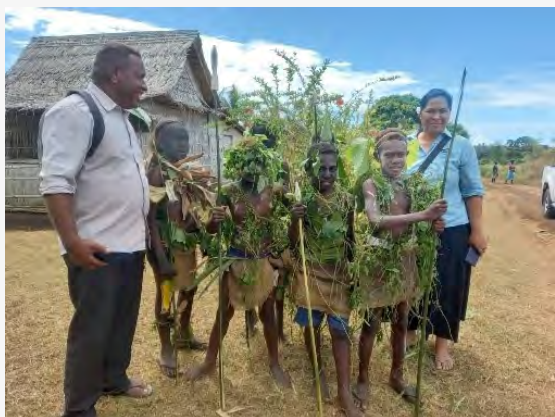
Traditional Guadalcanal Welcome by Aurologo students