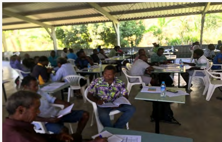
School leaders during the training - group discussion